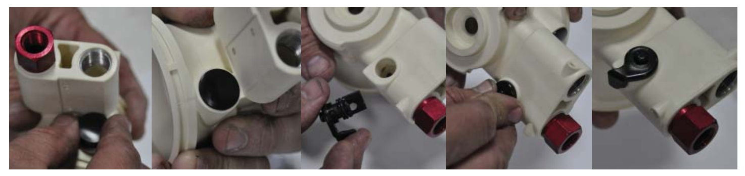
Press in vacuum plug in the hole below air inlet on housing by hand. Slide in speed control and plunger until fully seated.