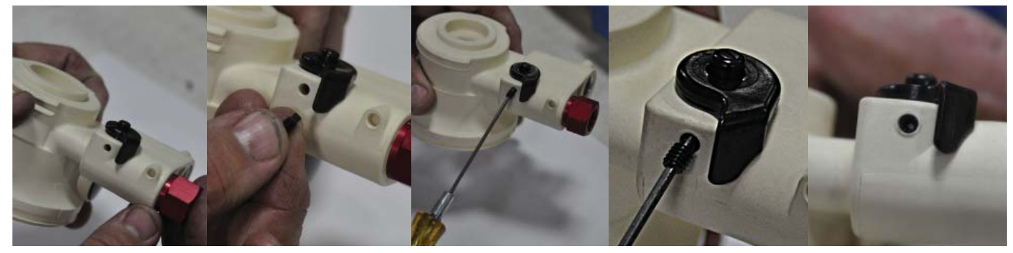
Rotate Speed control to OFF/BACK position. Screw in 8/32 full dog set screw until speed control has slight drag and then back out ¼ turn.