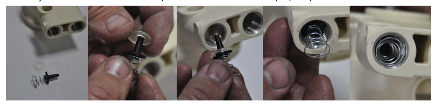
Install Air control (1530 includes valve, washer, spring & air control) in housing. Slide vinyl washer on tip of valve with spring attached. Insert all 3 parts into intake on left side of housing (1515).

NOTE: Under normal operation conditions, the air control assembly does not require service however if the air control assembly has been disassembled or the tool continues to run without depressing the trigger, the assembly MUST be re-assembled exactly as shown below to achieve proper operation.